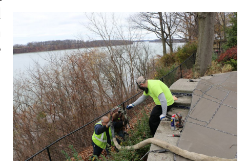
45 Degree Slope Down to River