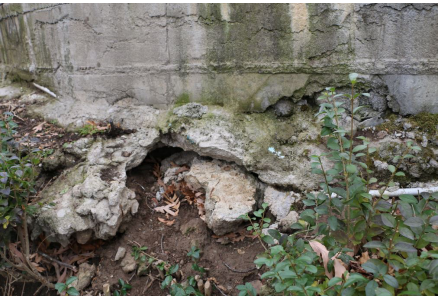
Cavity Beneath Wall

In one day, three team members from Bravo injected 538 lbs of Hydrofoam (immune to water) through piping 3/8 inch in size. The soil beneath the pool and outer edge was 100% stabilized and all voided cavities were filled. The homeowners were very pleased with how clean and quick the process was. They would recommend to any other home owner or business owner who sees the same issues on their property.